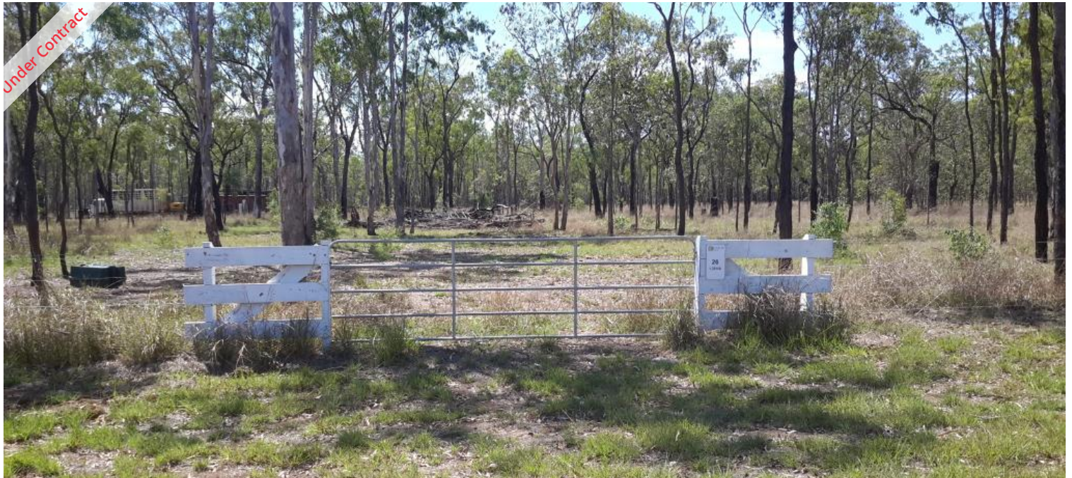
Lot 26, 14319 Kennedy Hwy, Millstream